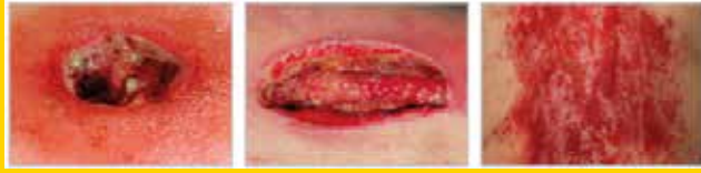
Abscess with cellulitis Infected wound Deep and extensive cellulitis

Acute Bacterial Skin and Skin Structure Infections (ABSSSI)